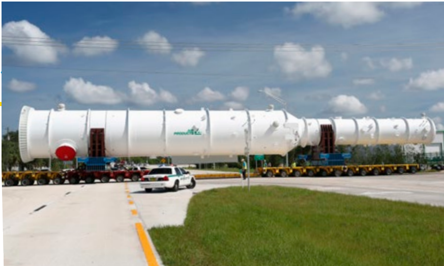
Air Products' natural gas liquefaction processes and main cryogenic heat exchangers are the world's standard for baseload LNG.