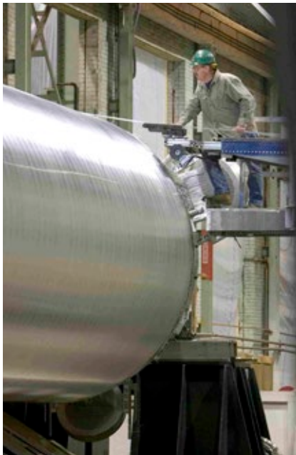
The bundle winding process for each coil wound heat exchanger manufactured by Air Products.