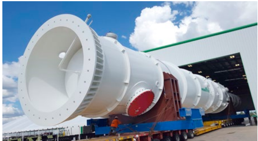
A large Air Products' custom designed coil wound heat exchanger.

For the AP-X® LNG Process, in addition to liquefaction process design and CWHEs (Coil Wound Heat Exchangers), Air Products designs and manufactures cryogenic nitrogen compressors (compressor turbo-expander machinery), and nitrogen economizer heat exchanger cold boxes.